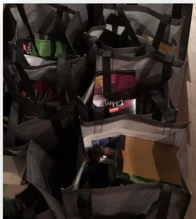
Some of the Goody Bags packed and ready for delivery